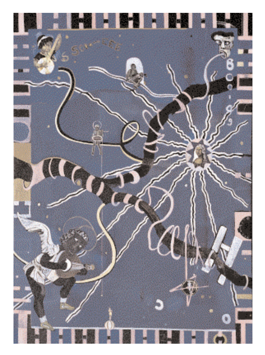
untitled 2000 oil and collage on canvas 7' x 5'