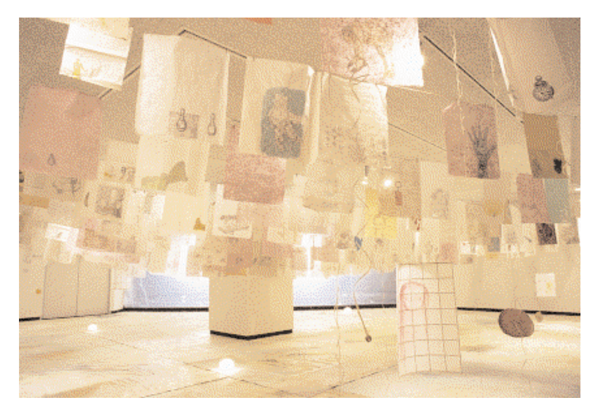
Comparsa 1999 installation view, acrylic and oil on canvas, light fixtures, wire, thread, paper, rubber and glue 9' x 41' x 40'