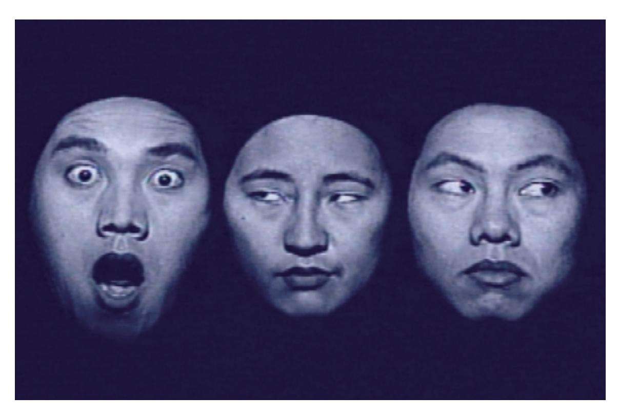
"Phases," from Small All Spring Fall 1999